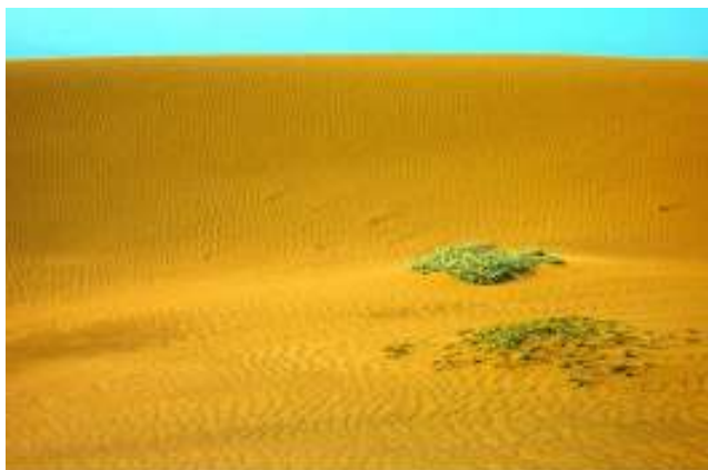
"Ocean of His Silence"