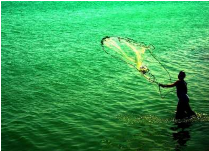
"Evening Catch, Morning Sun", Puerto Rico